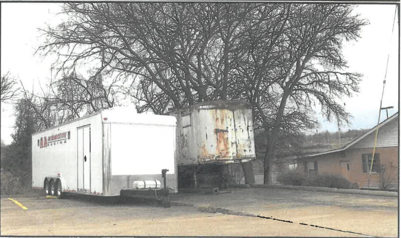
TRAILERS BEING USED FOR STORAGE