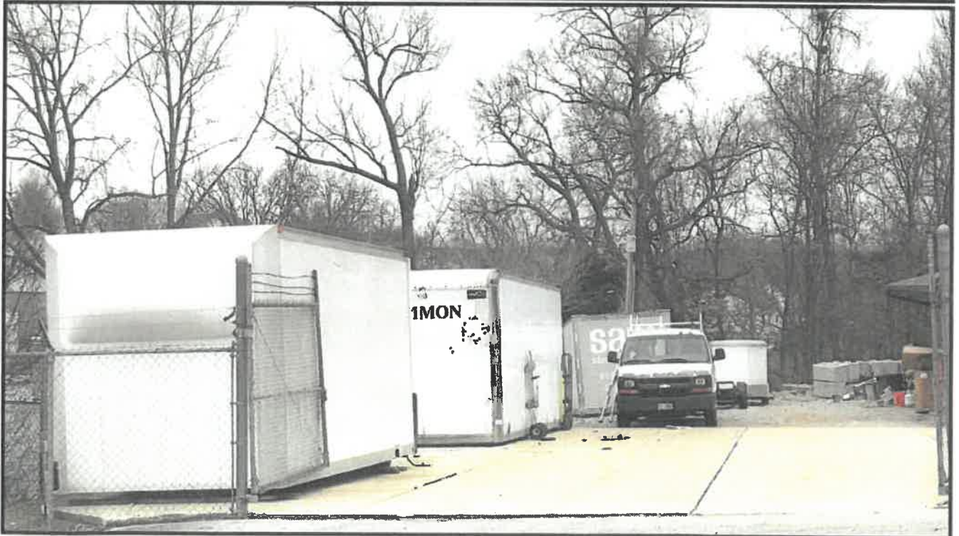
TRAILERS BEING USED FOR STORAGE