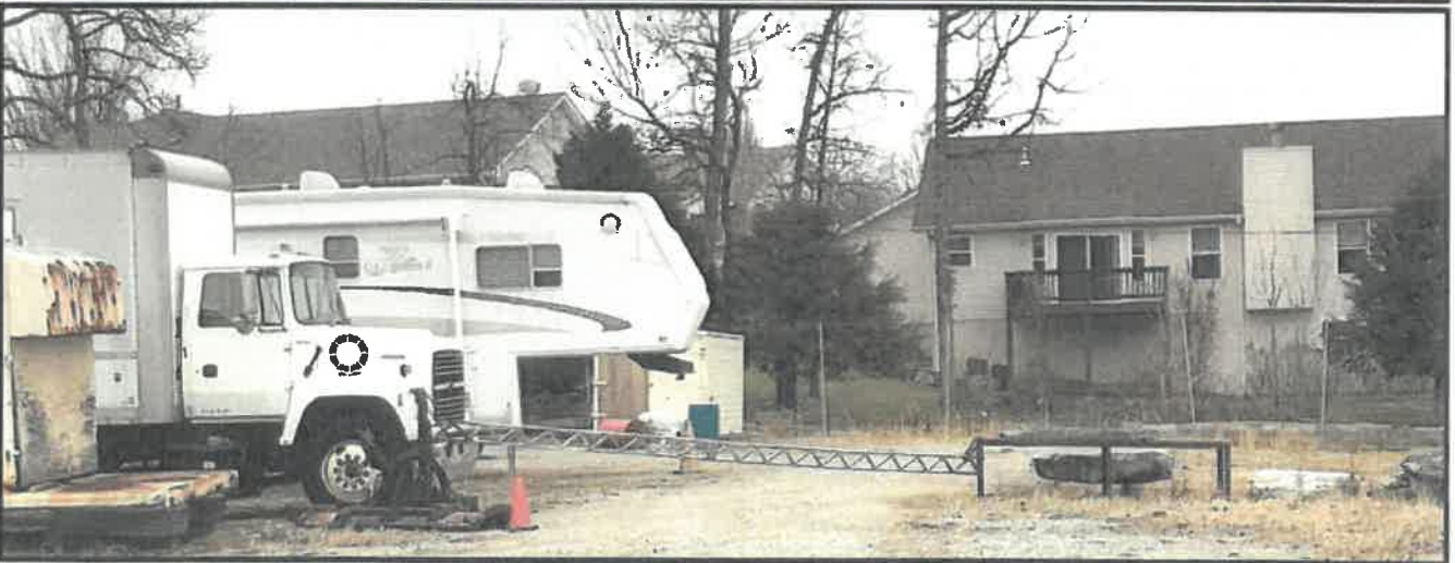
TRAILERS BEING USED FOR STORAGE